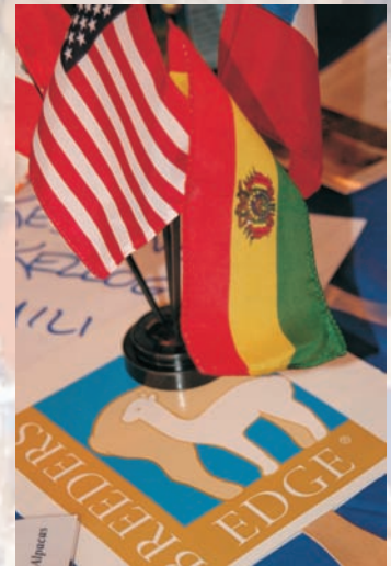
Flags from Peru, Chile and Bolivia joined the Stars and Stripes