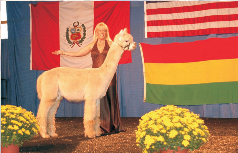
Superior alpacas kept all eyes on stage.